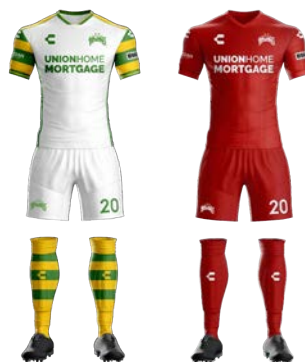
TAMPA BAY ROWDIES