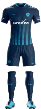
RHODE ISLAND FC