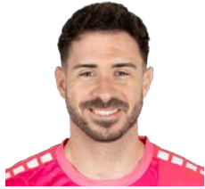
1 KOKE VEGAS GOALKEEPER