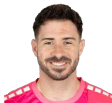
1 KOKE VEGAS GOALKEEPER