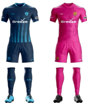
RHODE ISLAND FC