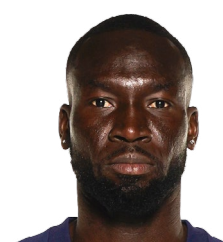
10 CHICO FORWARD