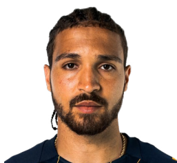
14 RIO HOPE-GUND DEFENDER