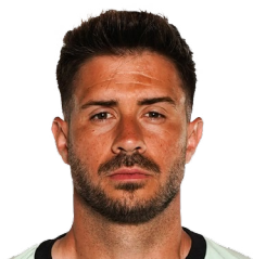
1 KOKE VEGAS GOALKEEPER