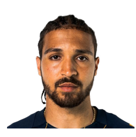
14 RIO HOPE-GUND DEFENDER